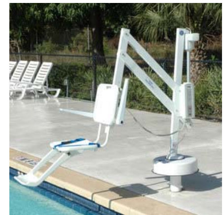
Splash Lift (STD)